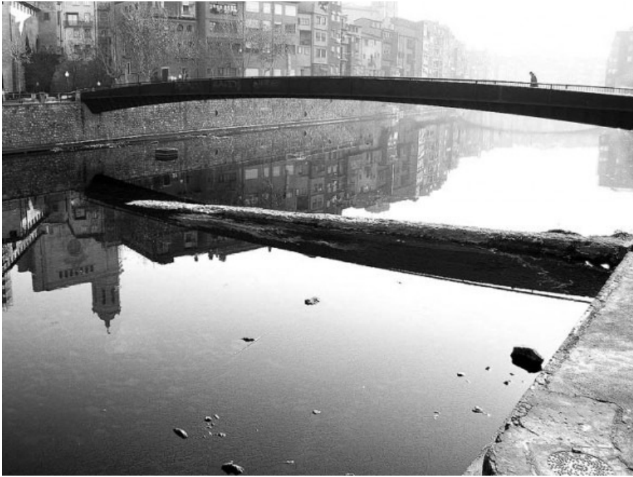
Bridge Above Still Water